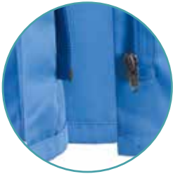
Open ended zip