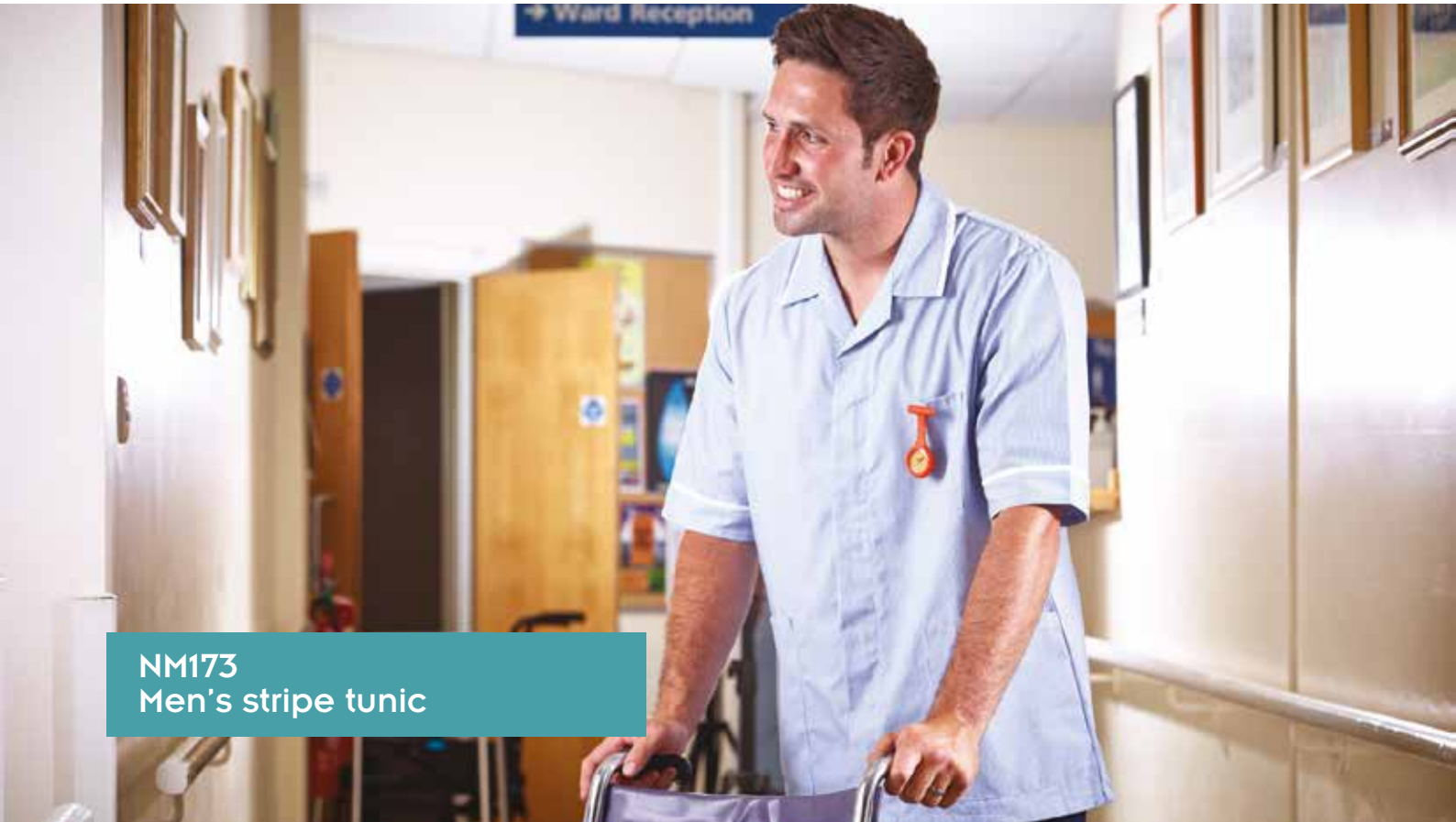
NM173 Men's stripe tunic