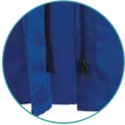
Open ended zip

33 colours available directly from stock, our biggest ever range for men