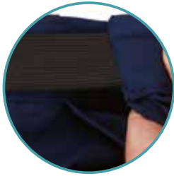
Hidden elasticated waist inside seam for ease of movement