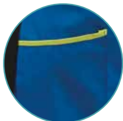
Shaped front patch pockets