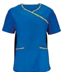
Blade blue/ lime